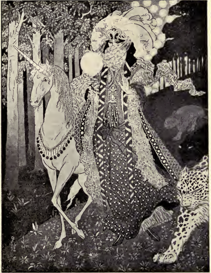
ROMANCE COMES DOWN OUT OF HILLY WOODLANDS